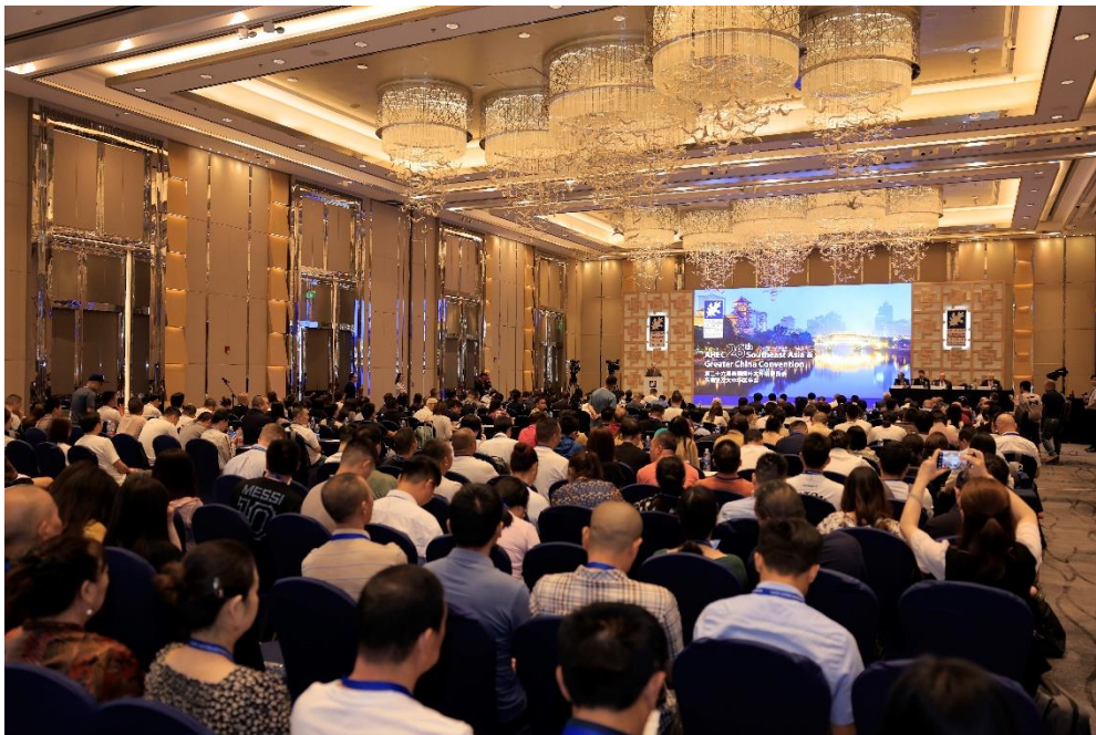
AHEC 26 th Southeast Asia & Greater China Convention was successfully held in Chengdu

September 2023, Chengdu, China – The American Hardwood Export Council (AHEC) 26 th Southeast Asia and Greater China Convention was held at JW Marriot Hotel Chengdu on September 8, 2023. As one of the most anticipated events in the wood industry, this year, AHEC held the conference with the theme of “Sustainable American Hardwood – The Future of Our Living Environment”. The convention was supported by Chengdu Furniture Chamber of Commerce and attracted nearly 300 architects, interior designers, timber contractors, traders, importers, wholesalers across Greater China and Southeast Asia and over 20 AHEC member companies to explore the sustainable development of American hardwood, the future of low-carbon, new technology, timber grading rules, and further promote application of American hardwood in architecture and interior design.